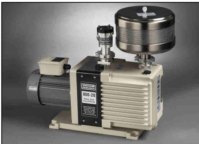
Photo shows Pump with optional inlet trap and exhaust mist eliminator installed. See pages 14 and 15 to order these accessories.