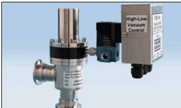
Photo shows the High-Low controller with standard NW-25 isolation valve