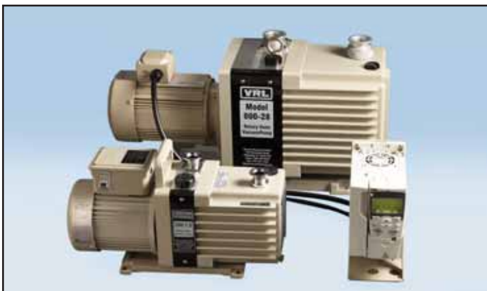
Photo shows Model 800-28 and Model 200-7 Pumps with the Soft Start Variable Frequency Drive (VFD) Unit