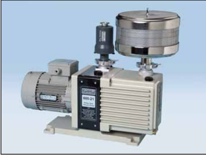
Photo shows Pump with optional inlet trap and exhaust mist eliminator installed. See pages 14 and 15 to order these accessories.