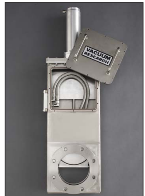
Water Cooled Gate and Port Flanges