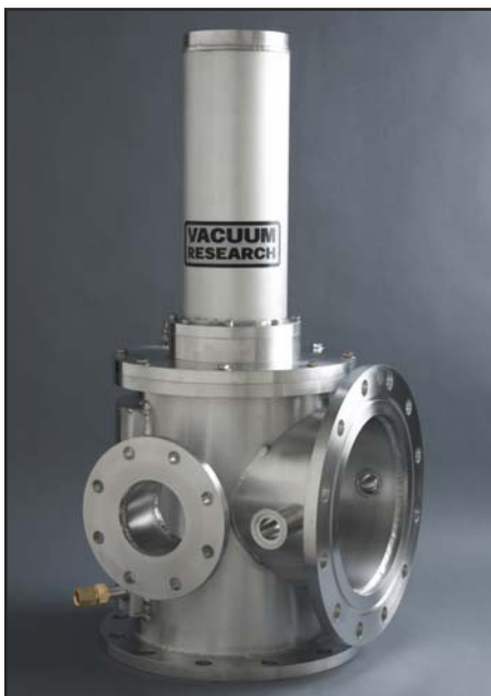
Poppet Valve with Cooling Shroud

Water cooled valves in both gate and poppet styles are available with ANSI flanges up to 32 inches and with ISO flanges up to 800 mm. Highly efficient cooling water circuits with low \Delta P and high overall 'u' maximize thermal transfer and minimize cooling water consumption. In addition to water cooling all valve styles can be provided with thermal radiation shields on the gate.