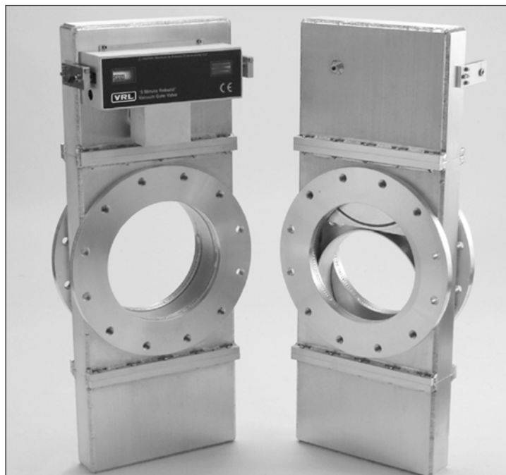
Valve on left is fully open with protective ring in place. Particles are directed through the port instead of into the valve body.

Although Vacuum Research valves are not affected by small amounts of dust and dirt some processes are so dirty that frequent cleaning is required. For such processes our Protective Ring Valve with the Dirt Sump can substantially reduce your costs by increasing the time between cleanouts. The Protective Ring and Dirt Sump are available on valves with port sizes from 2 to 24 inch (50 to 600 mm ISO). Other Vacuum Research options such as Position Indicators and ports for gauges and roughing can also be provided on these valves.