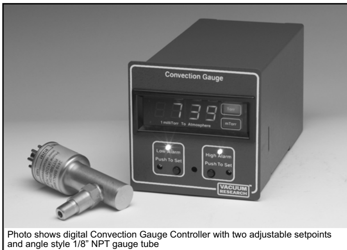
Photo shows digital Convection Gauge Controller with two adjustable setpoints and angle style 1/8" NPT gauge tube